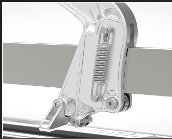
QUICK START SYSTEM The carriage is provided with springs that makes the handle always ready to cut.