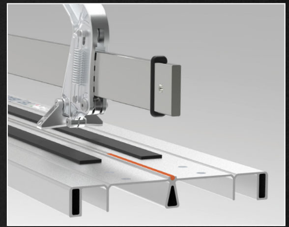
STRUCTURE Strong body made in aluminium draw-plate to get rigidity and lightness at the same time.