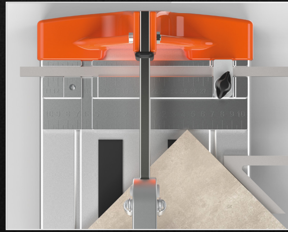
DIAGONAL CUTS Square ruler with direct reading for diagonal cuts .